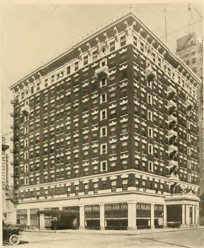
THE BENDER HOTEL