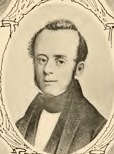
JOHN K. ALLEN FOUNDER OF HOUSTON.