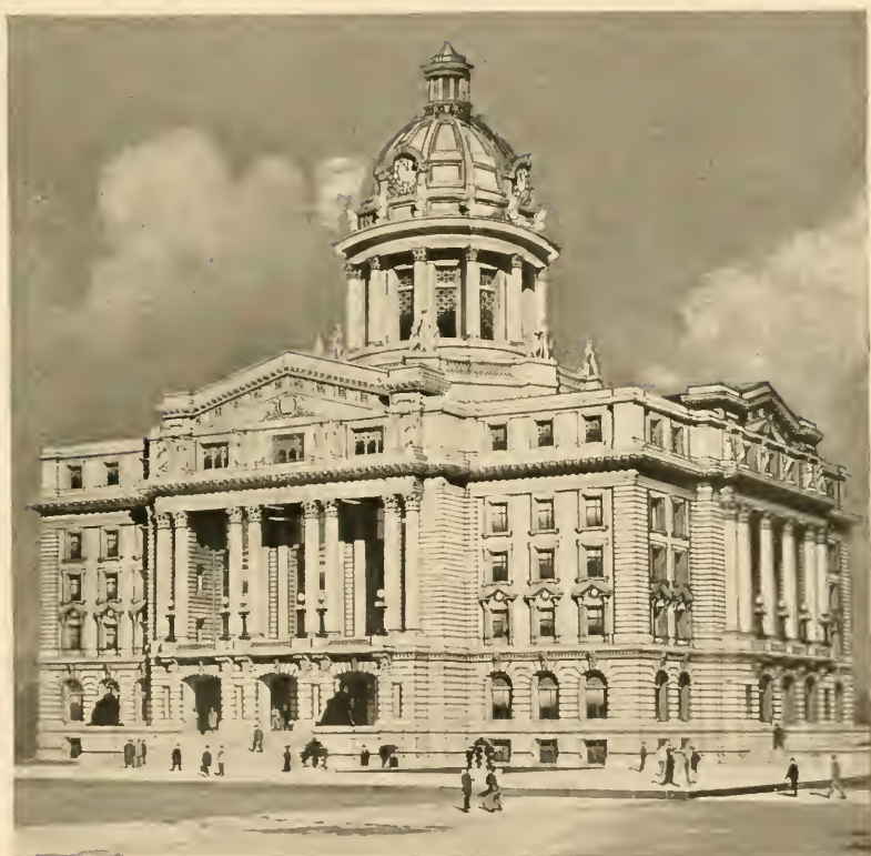
HARRIS COUNTY COURT HOUSE