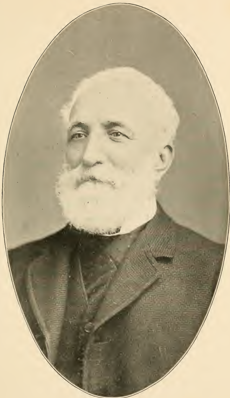
PAUL BREMOND Pioneer Railway Builder