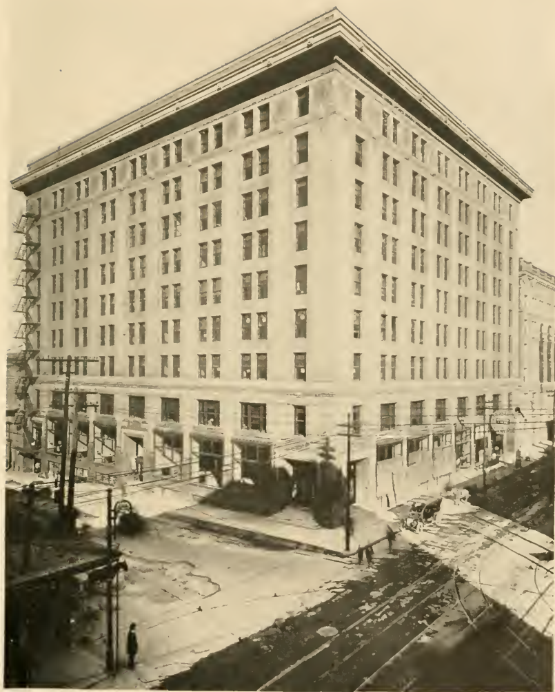
SOUTHERN PACIFIC OFFICES