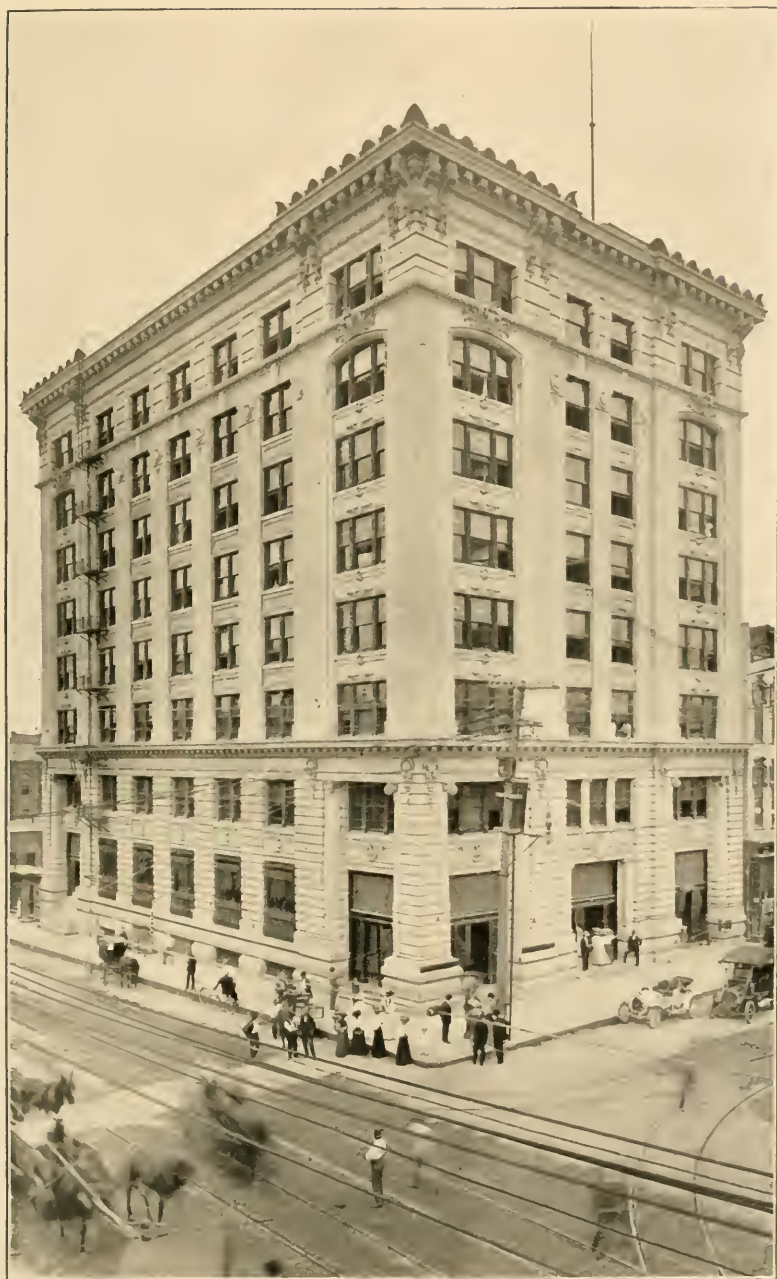
FIRST NATIONAL BANK BUILDING