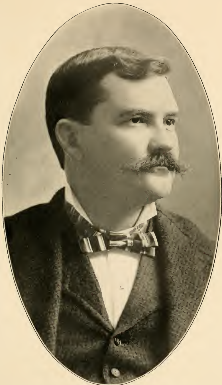
H. BALDWIN RICE The Great Mayor of a Great City