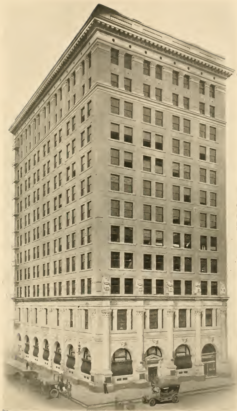
UNION NATIONAL BANK