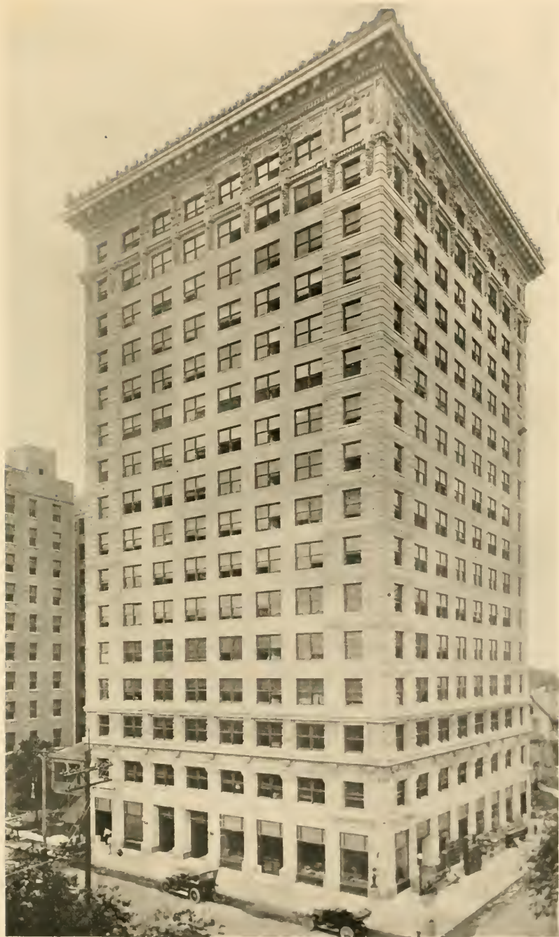
THE CARTER BUILDING